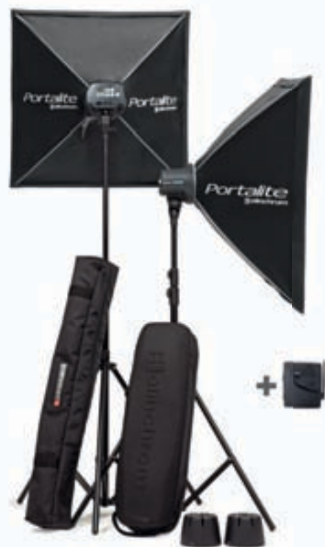
D-LITE RX ONE SOFTBOX SET N° 20843.2