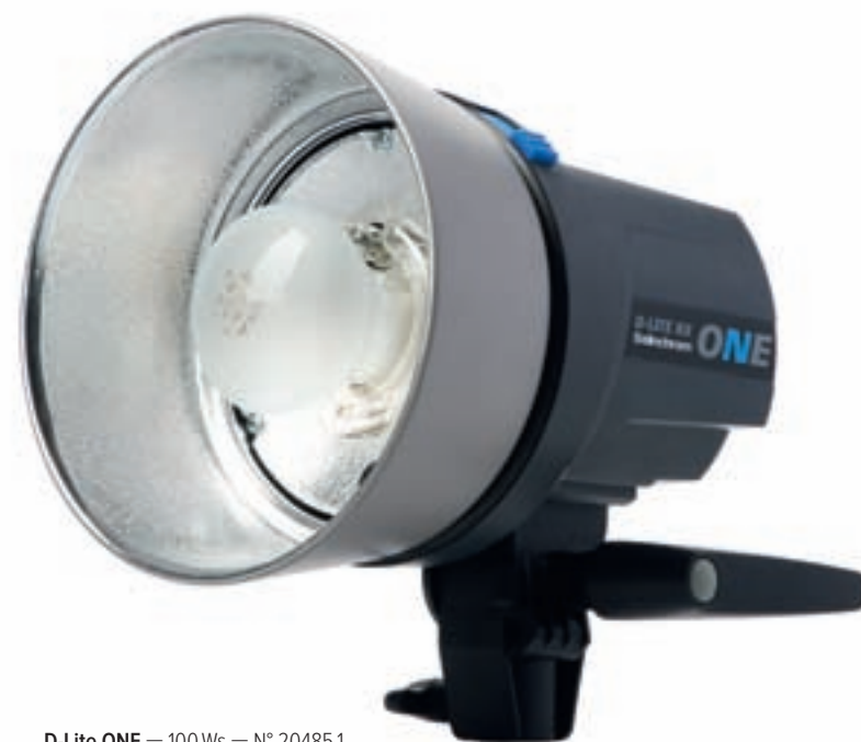
D-Lite ONE – 100Ws – N° 20485.1

Used outside the studio, the D-Lite RX ONE is the perfect creative companion to an existing Speedlight system, making use of the built-in Intelligent Slave Cell to offer perfect flash synchronisation.