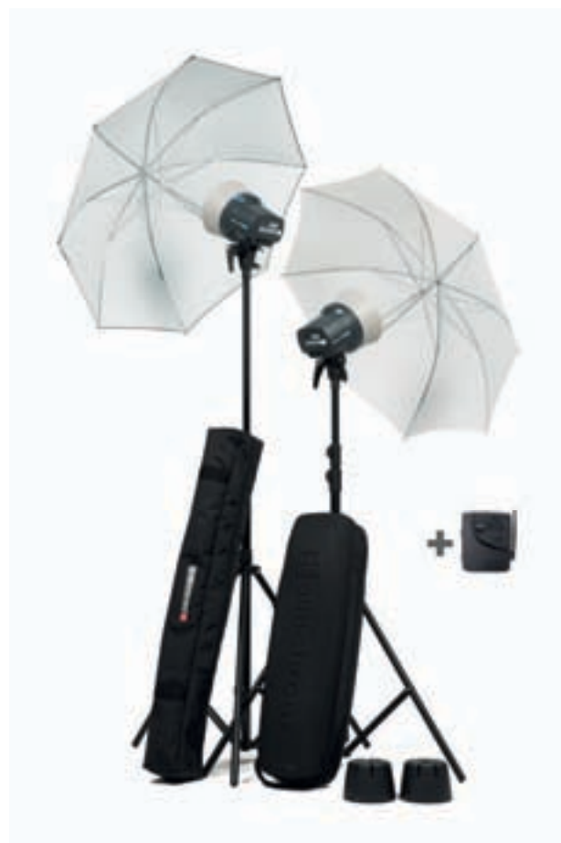
D-LITE RX ONE UMBRELLA SET N° 20844.2