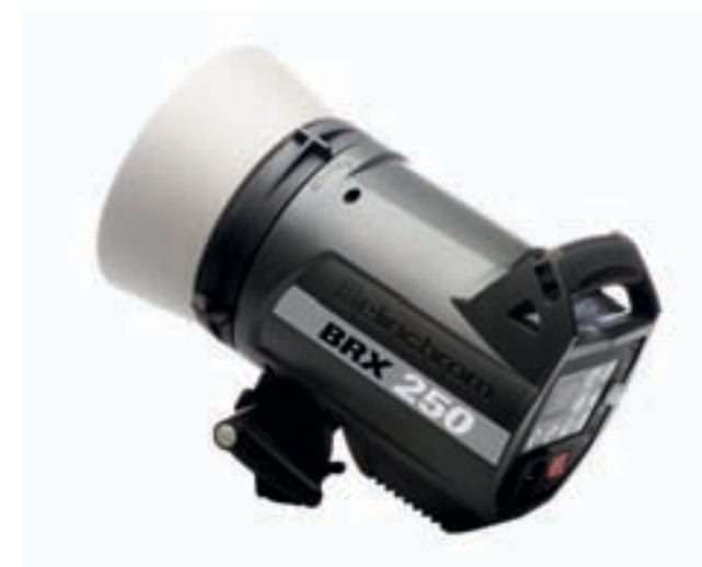
BRX 250 — 250Ws — N° 20440.1