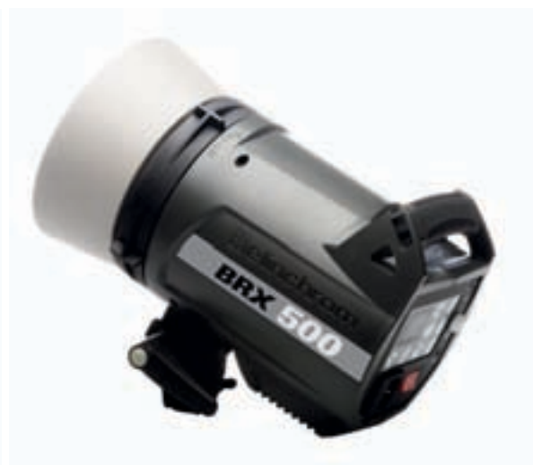
BRX 500 — 500Ws — N° 20441.1