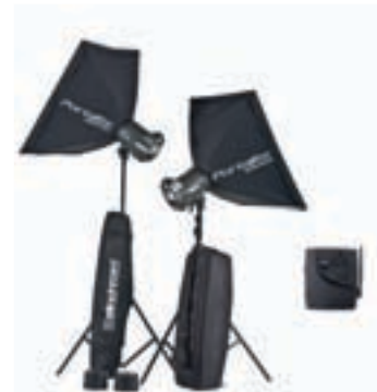
BRX 250/250 TO GO N° 20756.2