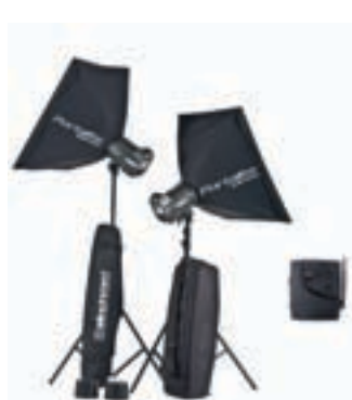
BRX 250/500 TO GO N° 20757.2

The BRX basic sets all fit it to one bag for easy transportation. Optional stand sets are available depending on your needs such as 88-235 cm stands or air cushioned 102-264 cm stands. All sets come with two Portalites, which when combined with the optional deflector set take advantage of the unique Elinchrom central shaft.