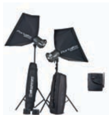
BRX 500/500 TO GO N° 20758.2